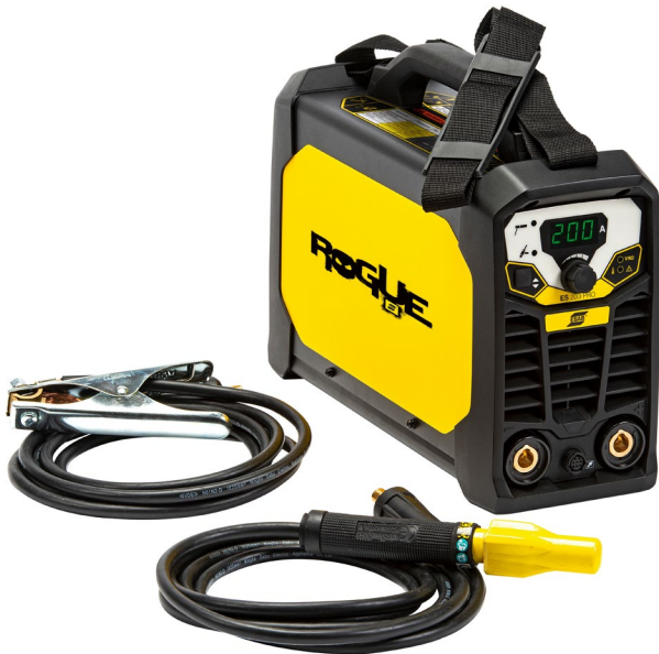
Rogue ES 200i PRO